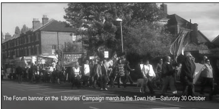
The Forum banner on the Libraries' Campaign march to the Town Hall—Saturday 30 October

We understand that the Age Concern Lewisham & Southwark Handy Person Project will be coming to an end because of funding cuts. This is very sad news indeed as we know that many of our members were helped by the services this project made available. The Forum will be expressing its concern to Lewisham Council who supported the project as we fear that this project along with many others that benefit the lives of so many will simply just disappear in pursuit of a damaging cuts programme.